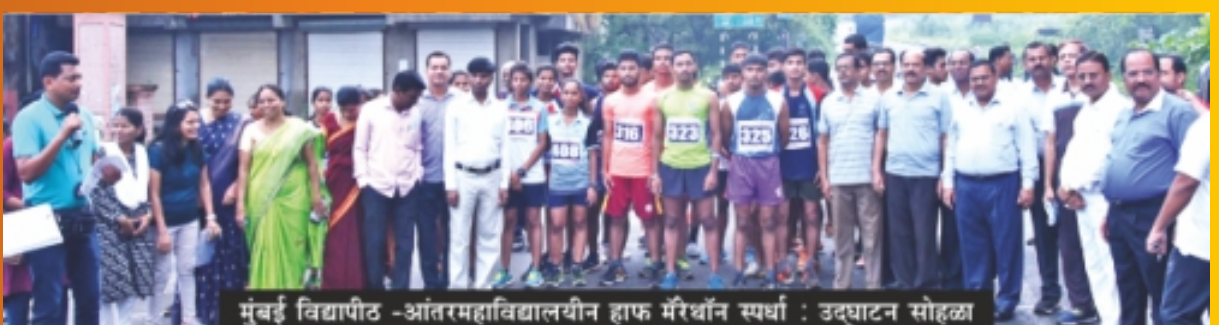
मुंबई विद्यापीठ -आंतरमहाविद्यालयीन हाफ मॅरिथॉन स्पर्धा : उद्घाटन सोहळा