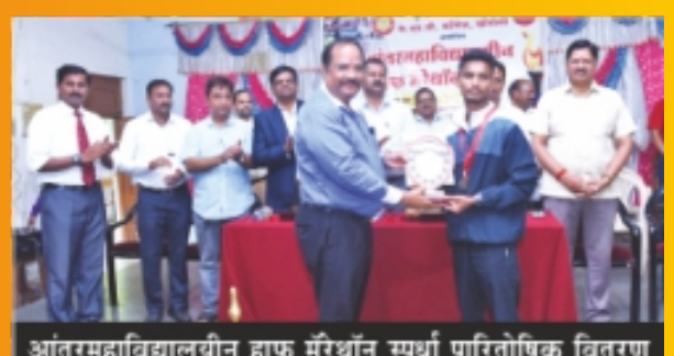
आंतरमहाविद्यालयीन हाफ मॅरिथॉन स्पर्धा पारितोषिक वितरण