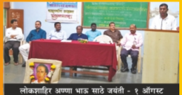
लोकशाहिर अण्णा भाऊ साठे जयंती - १ ऑगस्ट