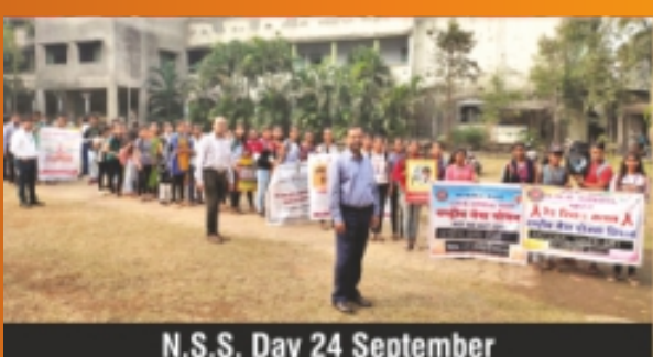
N.S.S. Day 24 September