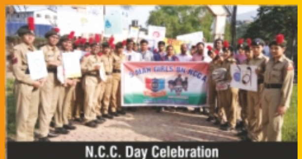
N.C.C. Day Celebration