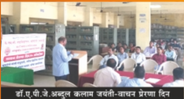
डॉ. ए. पी. जे. अब्दुल कलाम जयंती-वाचन प्रेरणा दिन