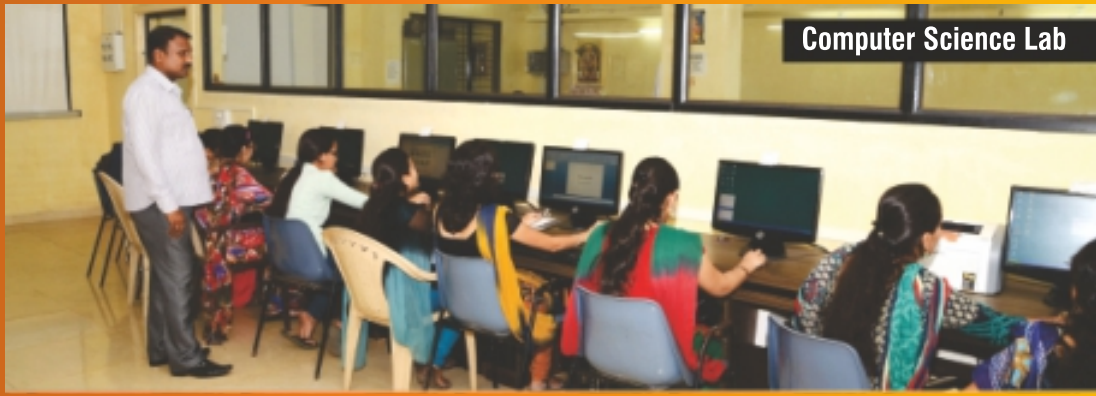
Computer Science Lab