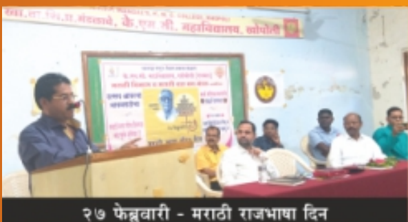
२७ फेब्रुवारी - मराठी राजभाषा दिन